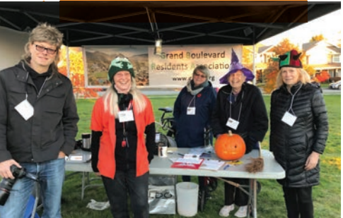
First Pumpkin Walk on Grand Boulevard