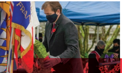
Laying a wreath on Nov 11