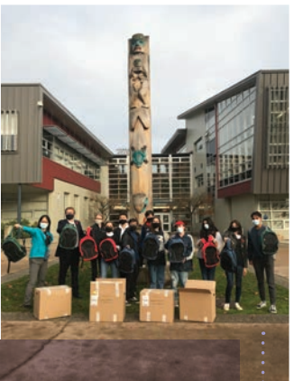
Sutherland Backpack Buddies donation from Telus