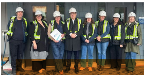
Indigenous-owned NUQO's modular building for WVSD45