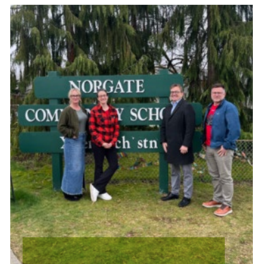
Visiting Norgate Community School in February